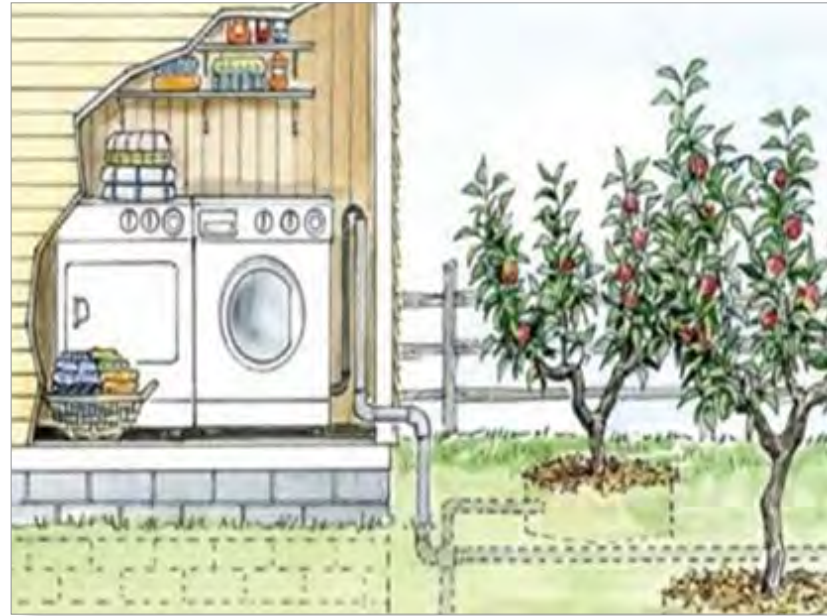
Grey water systems use water from washing for other purposes, such as irrigation